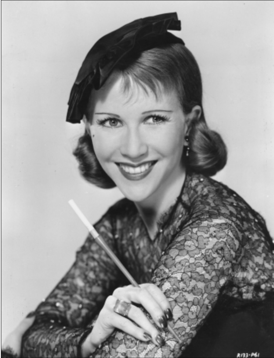
• Julie Harris with 'a little cap stuck jauntily on her pale flame-colored hair' in a publicity still for I Am A Camera (1955); for Christopher Isherwood she embodied the essence of Sally Bowles.

The book was really rather bitter, and Holly Golightly was real – a tough character, not an Audrey Hepburn type at all. The film became a mawkish